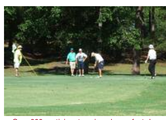
Over 200 participants enjoyed a perfect day on the golf course.

Last, but not least, was the annual Faith Radio Golf Tournament in September. The weather was beautiful and the fellowship was bountiful at our chief fundraising event of each year. We were grateful to Jesus and our ministry partners. Thank you for supplying for the needs of Faith Radio! God is using this ministry to proclaim His Word to the lost and the saved.